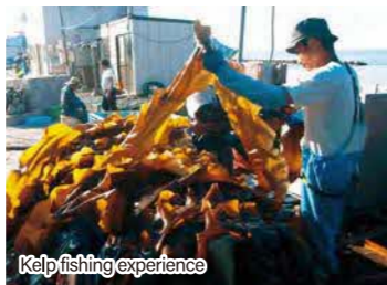
Kelp fishing experience