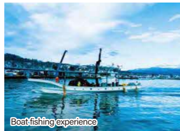
Boat fishing experience