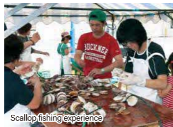
Scallop fishing experience