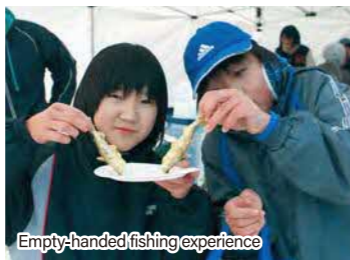
Empty-handed fishing experience