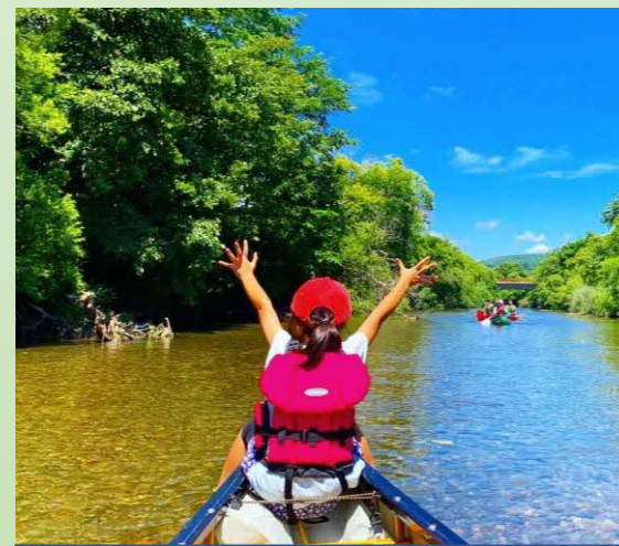
川下りカヌー River canoe