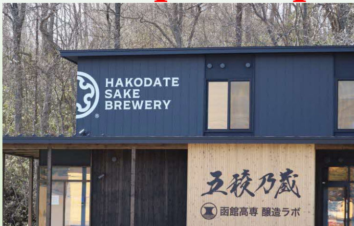
函館の新酒蔵「五稜乃蔵」 Hakodate Sake Brewery Goryonokura