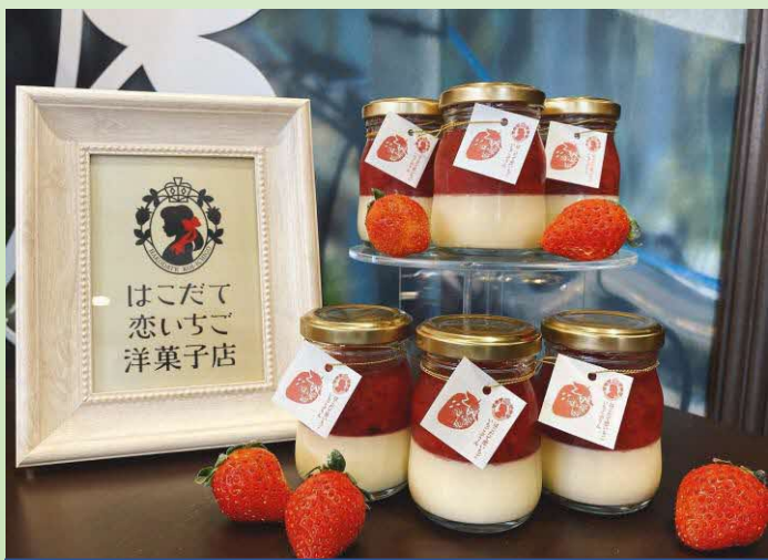
はこだて恋いちご洋菓子店 Hakodate Koi Ichigo