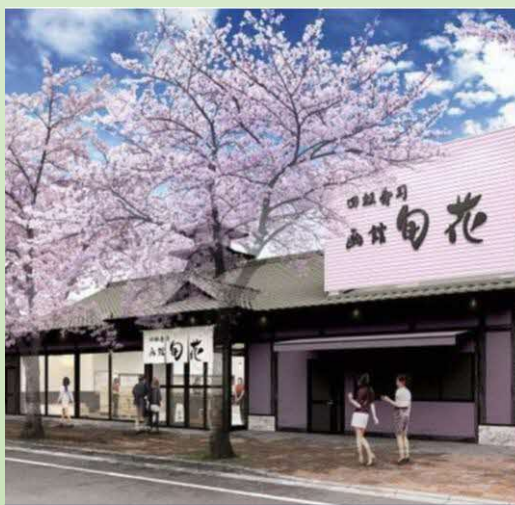
回転寿司 函館 旬花 Sushi Hakodate Shunka