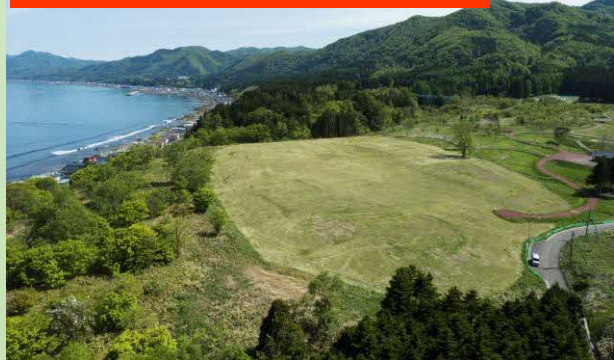
Kakinoshima site 垣ノ島遺跡