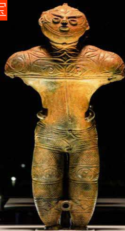
made about 3,500 years ago

Clay figure "Kakku" National treasure 中空土偶 カックウ 国宝