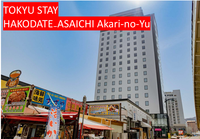
TOKYU STAY HAKODATE-ASAICHI Akari-no-Yu