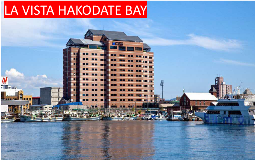
LA VISTA HAKODATE BAY