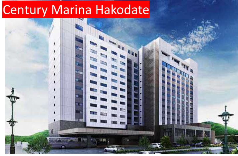
Century Marina Hakodate