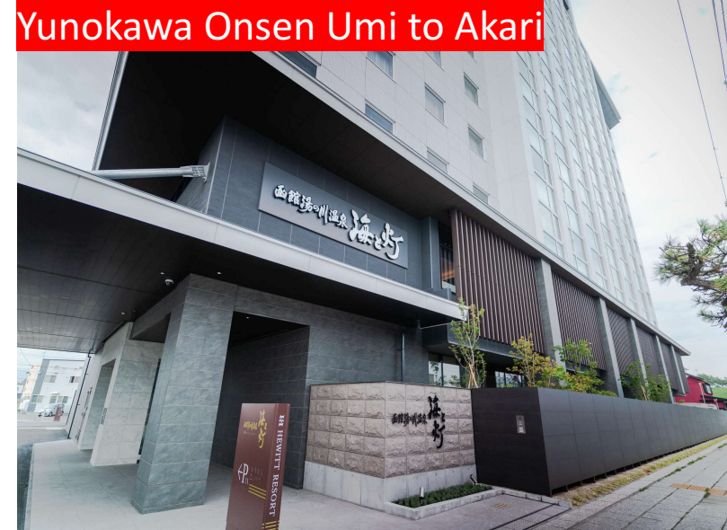
Yunokawa Onsen Umi to Akari