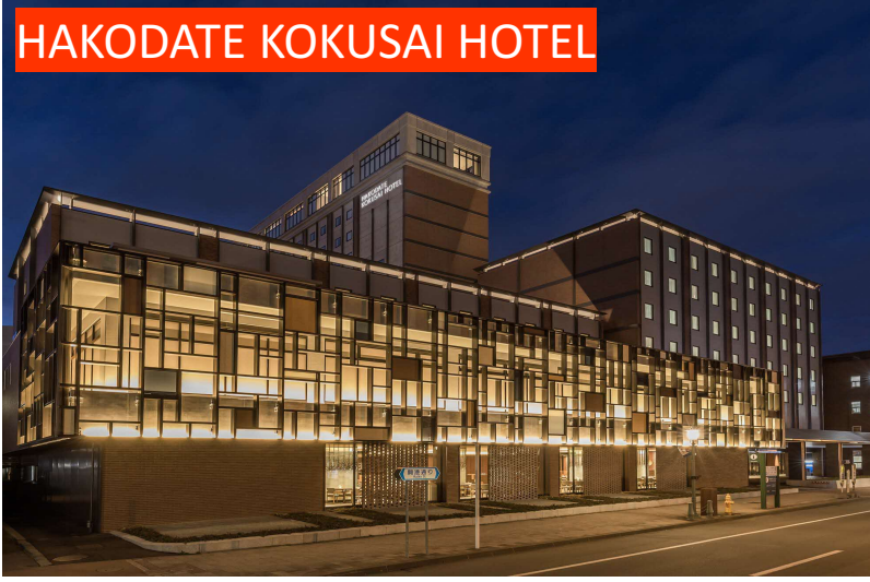
HAKODATE KOKUSAI HOTEL