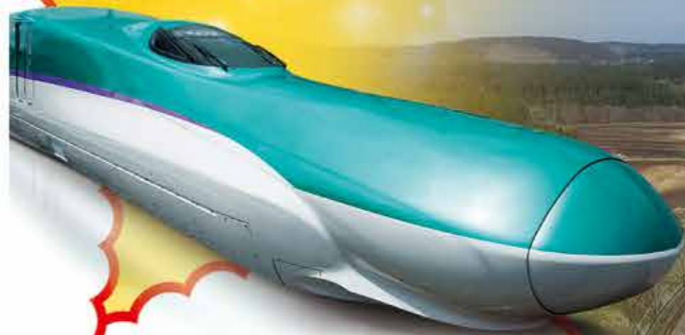
A Kikonai Specialty