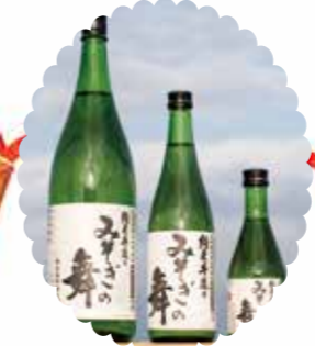
A Kikonai Specialty