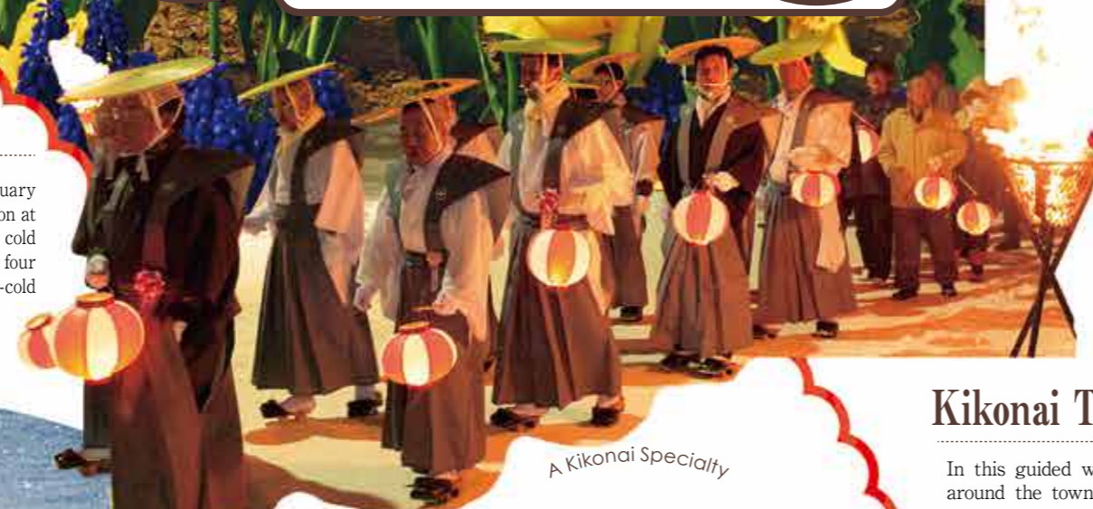
A Kikonai Specialty